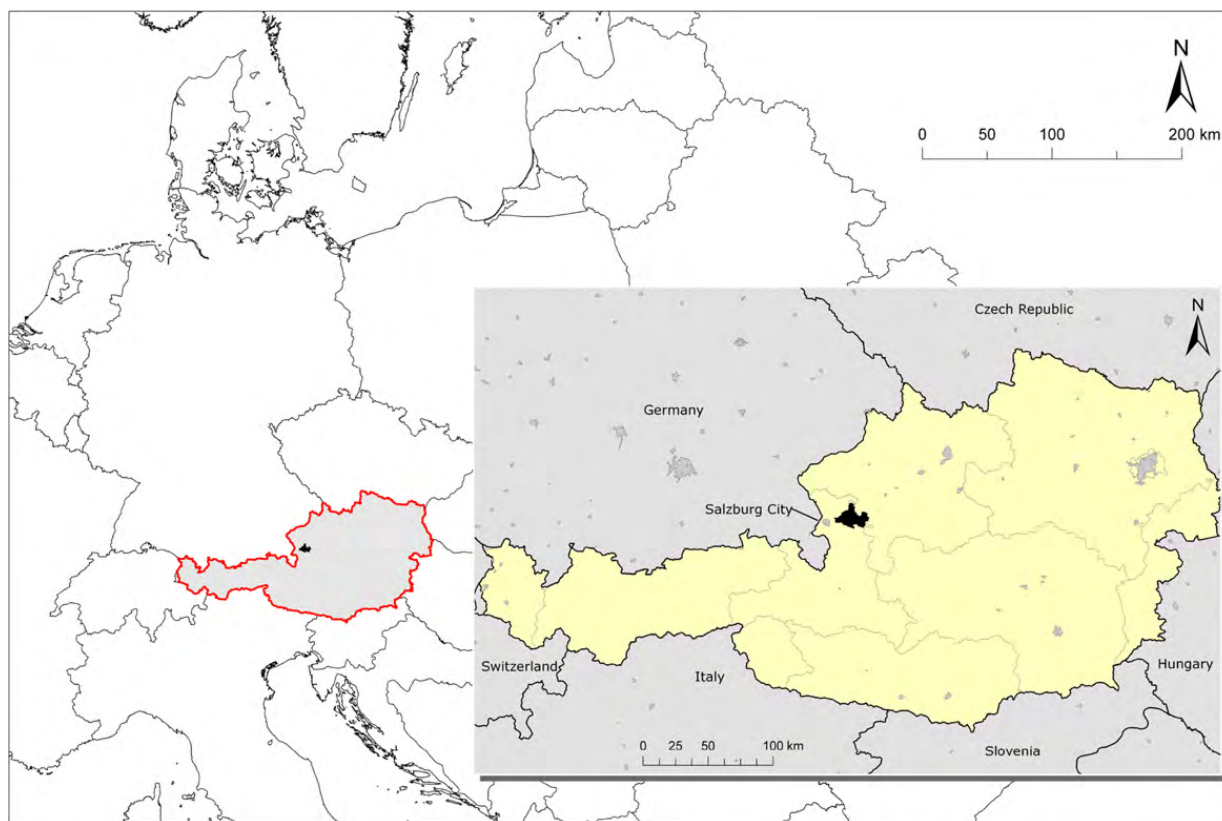
Fig. 2. The case study area: the Mondsee catchment.

subject to intensive farming, and the use of fertilisers has led to significant nutrient input into the lakes through runoff – resulting in eutrophication. Recent measurements observed from 2001 to 2003 put evidence to the increase of phosphorus loads into Mondsee catchment [18].